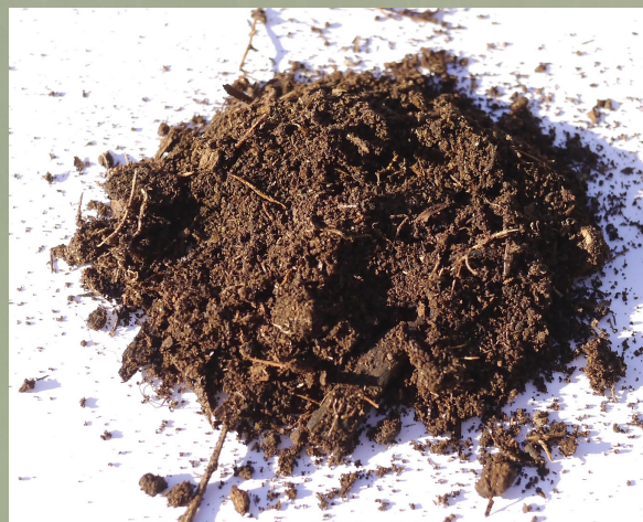
Rhizobia inoculant soil collected from an Acacia in the garden.

Most Acacia species do not strictly require this inoculant for germination, but it will help with overall health and vigour of some species. If you have an Acacia in your backyard or neighbourhood, simply take a handful of soil from the base of the tree. Avoid disturbing the roots of the Acacia too much, very little soil is required.