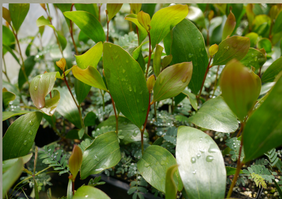
Acacia seedlings.

The following methods can be applied to many different Acacia species as well as other plants from the Fabaceae family. These instructions have shown particularly promising results for Acacia in the simple phyllode/flower spike group described in our Reference Guide for Common Wattles . Community members have reported sowing seeds directly using the coke bottle tek terrarium technique , reducing repotting time and frequency of watering.