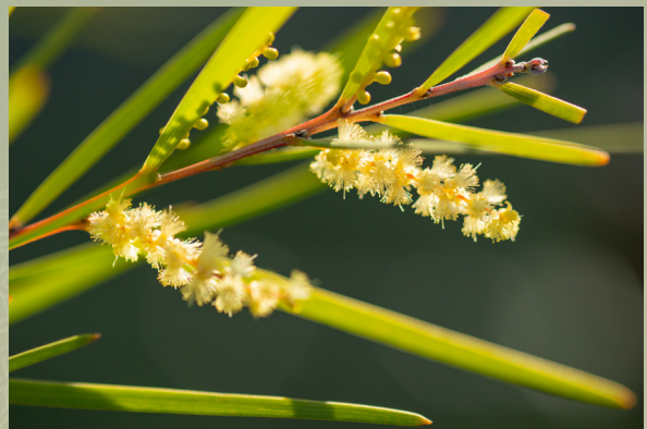
Mature Acacia, grown from seed.