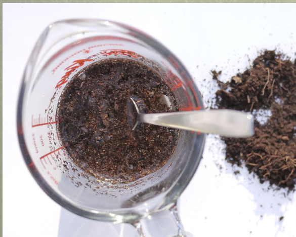
Acacia seeds in boiling water that has cooled, after the inoculation soil has been added.

Once the water has cooled add a teaspoon of rhizobia inoculant soil into the water, and mix.