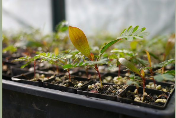
Acacia seedlings all start with bipinnate leaves and develop phyllodes as they age. Some of the seedlings pictured are starting to develop their first phyllodes.

Your Acacia seeds should germinate within two to four weeks.