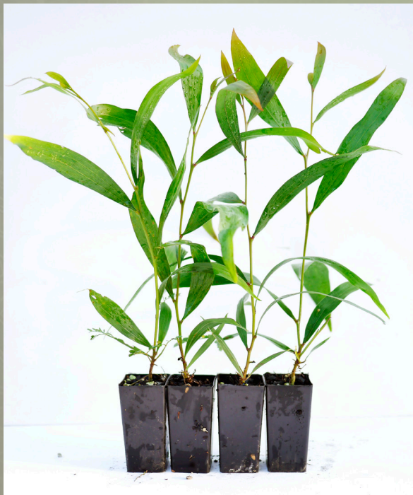
Happy Acacia seedlings, ready for planting in the ground.

Sprinkle slow-release fertiliser on top of the potting mix every few months. In 4-6 months, your seedlings will be ready to be planted in the ground.