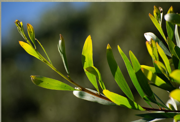
Mature Acacia, grown from seed.