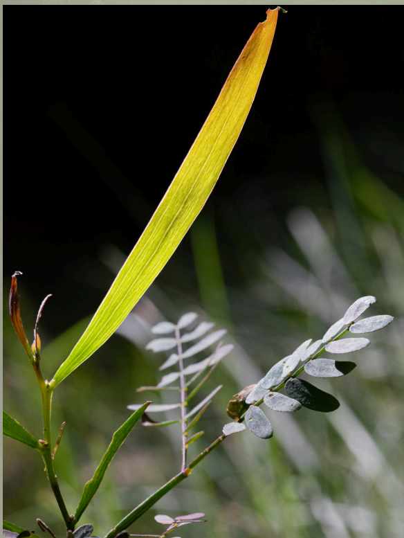
Acacia seedling. Picture of remains of bipinnate leaves below, with a fully developed phyllode above.