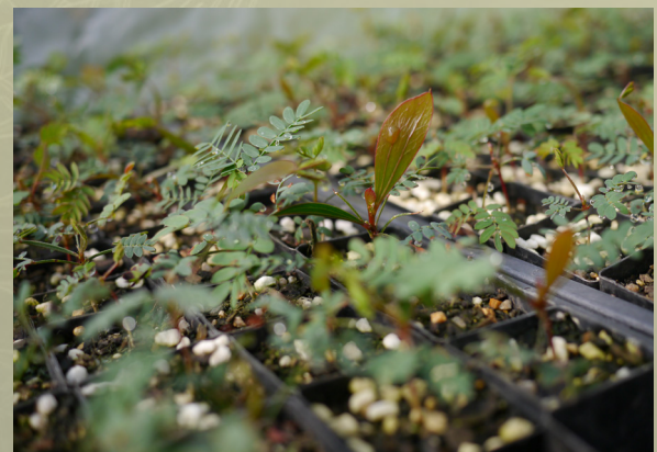
Acacia seedlings.