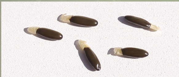
Acacia seeds.

Acacia species, also known as wattle, are iconic Australian trees. Australia boasts over 1000 different Acacia species, which typically bloom in shades of yellow, with blossoms emitting rich, sweet, honey aromas. Acacia trees are one of Australia's most common entheogens. With some Acacia populations being threatened by human harvesting in the wild, we can protect Acacia by preferencing cultivated plants and by growing wattle trees ourselves. We hope this guide will help protect wild trees by encouraging individuals to grow their own trees.