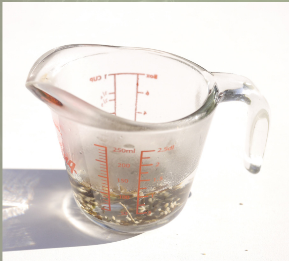
Acacia seeds in boiling water, cooling before inoculation soil is added.

Place the seeds in your mug and cover them with boiling water. This mimics a bushfire scenario, where sudden intense heat triggers seeds to wake up. Floating seeds are likely not viable, but you can keep or remove them from the mug as you wish.