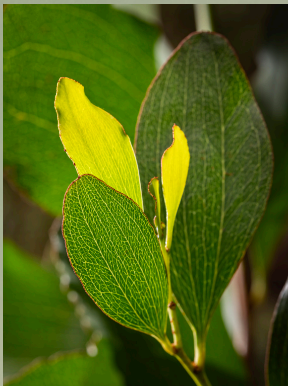
Phyllodes of an endangered Acacia, grown from seed.