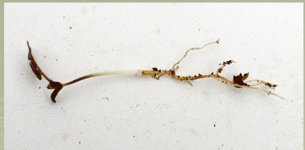
A delicate Acacia seedling, just recently germinated.

Once your seedlings have reached 1-2 cm in height (~6 weeks after germination), use your dipstick to gently jiggle the seedlings free from the tray. Be careful not to damage the seedlings' roots.