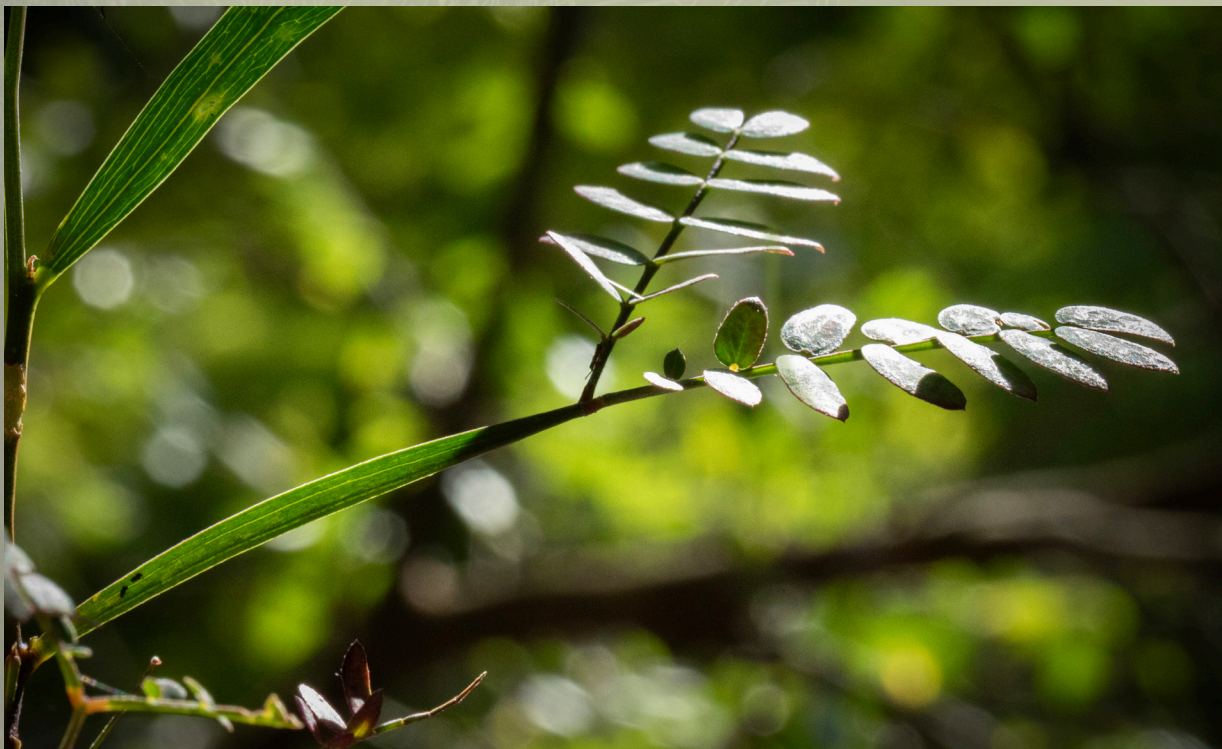
Acacia seedling. Picture of a petiole developing into a phyllode.