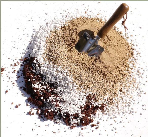
Germination soil ingredients, ready for mixing.

We recommend wearing a face mask as some soils contain particulate matter that is unhealthy to inhale. Gloves are worthwhile for protecting your hands, too.