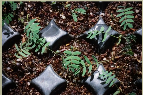
Acacia seedlings.