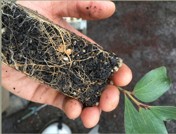
Healthy roots on an Acacia seedling.

Water seedlings daily, and occasionally apply seaweed fertiliser.