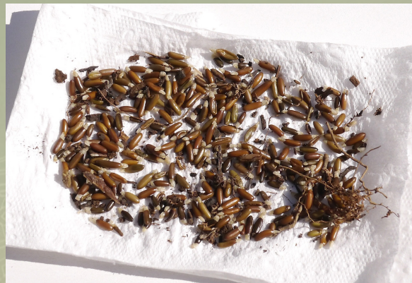
Acacia seeds after soaking. Note the seeds have absorbed water and become plump.

Allow your inoculated water, seed and soil mix to sit for 24 - 48 hours, then strain the seeds from the mix using your sieve. Set the seeds aside on a paper towel.