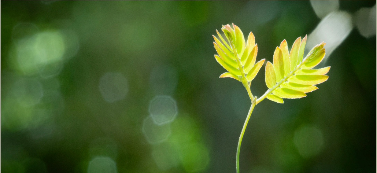
Acacia seedling.